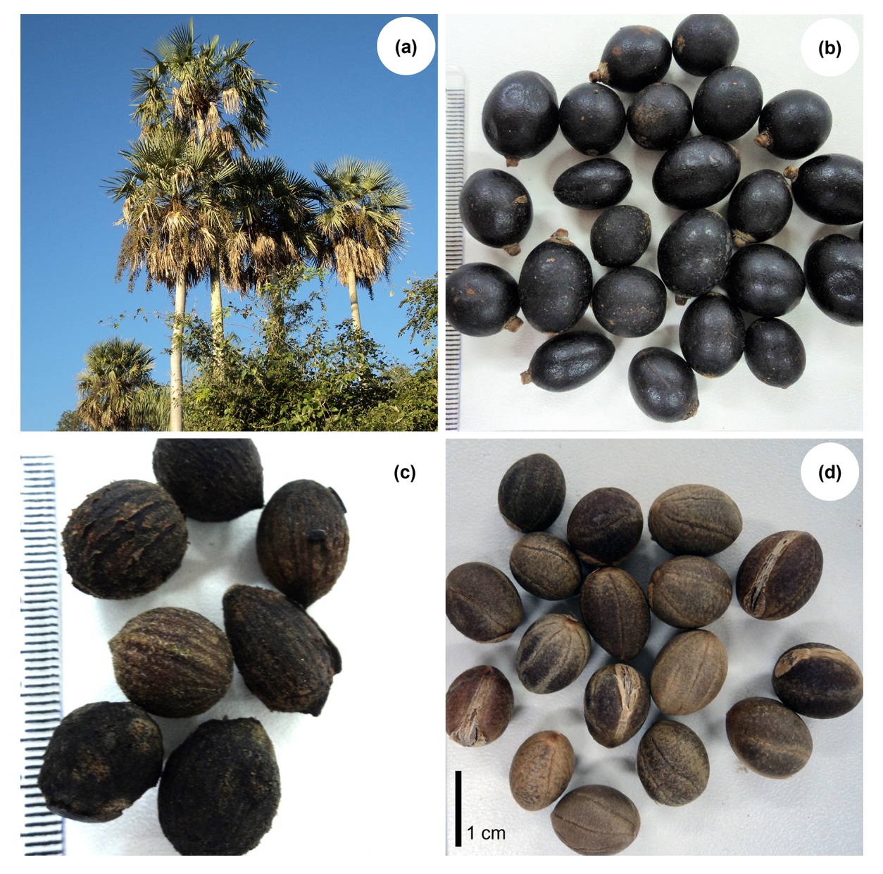
Figure 1. Copernicia alba Morong from a natural population (locally named carandazal) of the Pantanal wetland, in Miranda, Mato Grosso do Sul State, Brazil. a. Adult plants. b. Mature fruits. c. Fruits with exposed mesocarp. d. Pyrenes (seeds surrounded by a rigid endocarp).

Harvesting involved cutting the outer branches and dislodging the fresh fruit bunches with a tree pruner, and then fruits fell freely on the plastic wrap placed on the ground. We took the fruits to the Seed Laboratory at Universidade Federal do Mato Grosso do Sul, Campo Grande campus , where the experiments were carried out. The exocarp and mesocarp of the fruits were removed by manual friction; then, the pyrenes were inspected for fungal infection and insect attack. All pyrenes were mixed in a lot. Mature fruit is a dry, fibrous drupe with an ovoid shape and black color, which consists of an exocarp, a fibrous mesocarp, and a stony endocarp with 1-2 cm in length that encloses the seeds and is called pyrenes