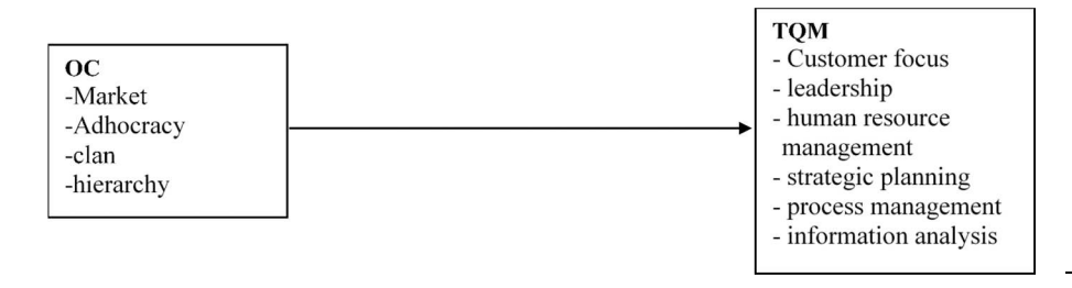
Figure 1. Research framework

Data collection was carried out using self-administered questionnaires to manufacturing SMEs managers/providers in Riyadh, Mecca and Eastern KSA. The population during the research was 5,820 (Ministry of Commerce & Investment, 2016) and Krejcie and Morgan (1970) guide to achieving the sample size in this context was 361. We used a cross-sectional design technique for the survey. Data collection was performed at a specific point in time (six months in 2017) and the calculated sample size was doubled to reduce errors and nonresponse problems (Hair, Celsi, Ortinau, & Bush, 2008). Therefore, 722 was the total number of questionnaires administered.