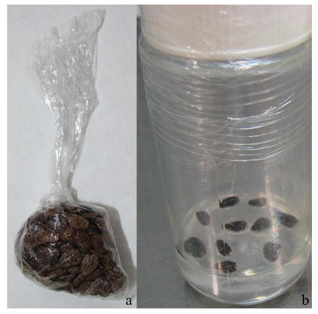
Figure 2. Type of storage of passion fruit seeds: a) conventional method and b) in vitro culture medium.

Three complementary experiments were performed. In the first, we verified the possibility of in vitro seed conservation for up to three years of storage, using as control the storage of seeds in the conventional form, in which the seeds