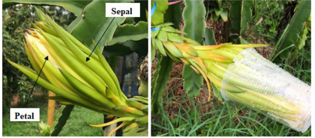
Figure 1. Flower with signs of opening and flower covered with plastic cup.

An experiment was conducted with a randomized block design composed of four treatments: T1: manual self-pollination (pollen placed on the stigma of the same flower); T2: nocturnal open pollination (flowers not covered with a plastic cup during the night); T3: diurnal open pollination (flowers not covered with a plastic cup during the day); and T4: manual cross-pollination (red-fleshed pitava [Hylocereus polyrhizus] pollen placed on whitefleshed pitaya [Hylocereus undatus] stigma). The experiment had four replicates, with two plants per replicate (two flowers per plant), totaling 16 flowers per treatment. The treatments were applied and evaluated in two crop years (2019 and 2020).