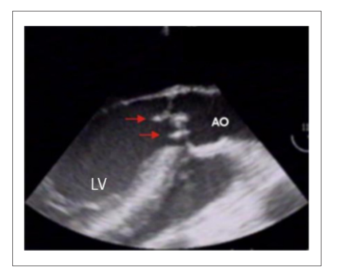
Figure 1 - Echocardiogram showing vegetation at the aortic bicuspid valve.

This study is not associated with any post-graduation program.