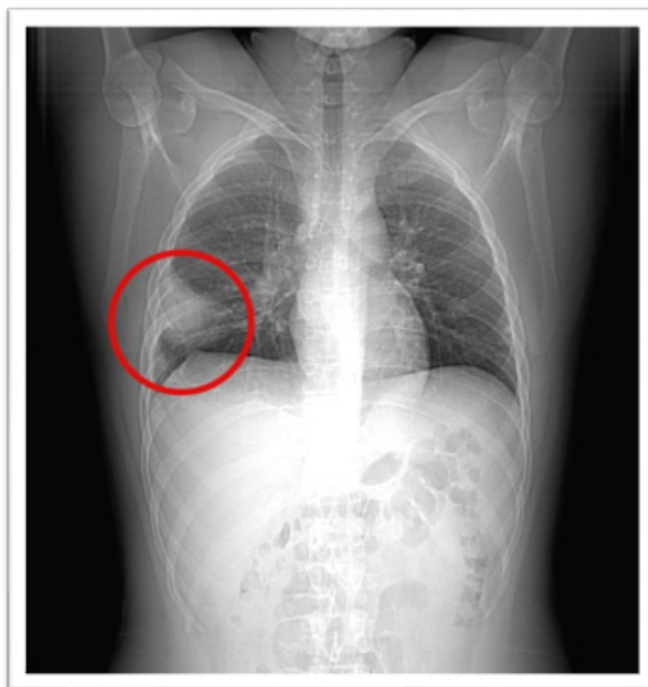
Figure 1 - CT scan performed at admission, showing Hampton's hump, a well-defined pulmonary pleural-based opacity representing hemorrhage and necrotic lung tissue in a region of pulmonary infarction caused by acute pulmonary embolism.

This study was approved by the Ethics Committee of the Pontifícia Universidade Católica do Paraná under the protocol number 30188020.7.1001.0020. All the procedures in this study were in accordance with the 1975 Helsinki Declaration, updated in 2013. Informed consent was obtained from all participants included in the study.