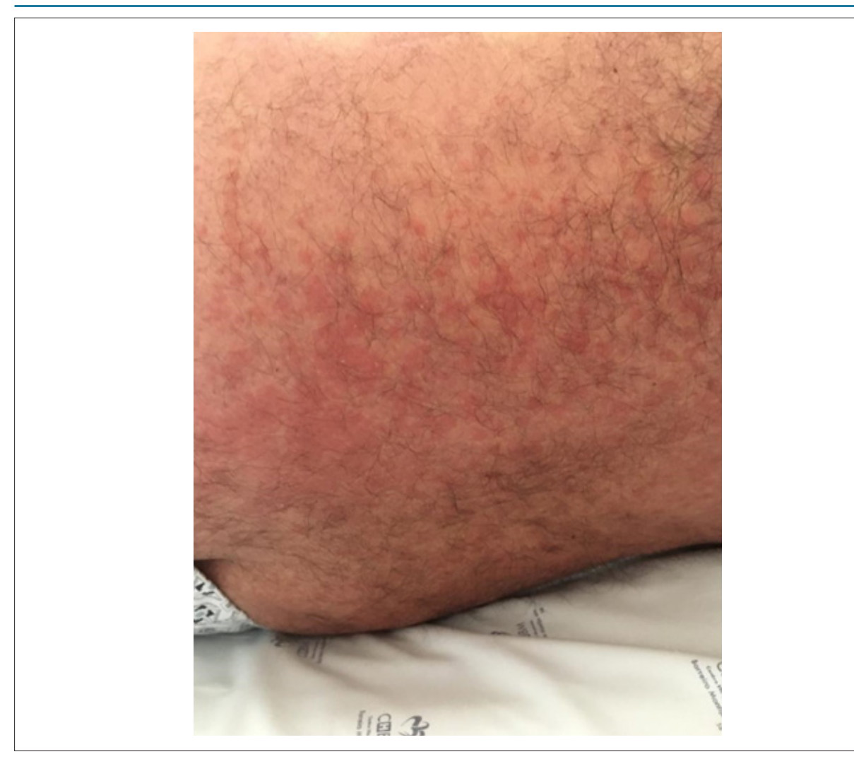
Figure 3 – Non-confluent, non-pruritic maculopapular rash on the back.