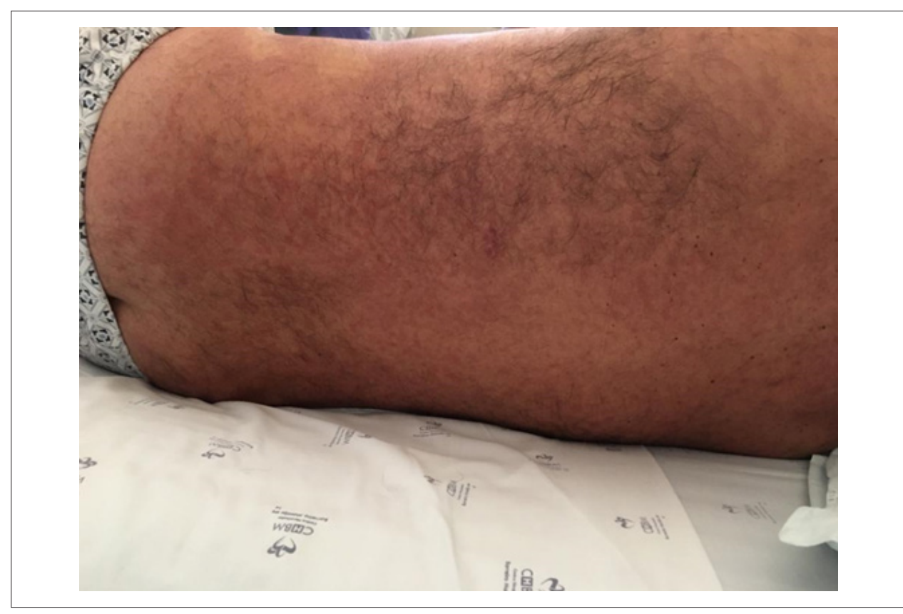
Figure 2 – Non-confluent, non-pruritic maculopapular rash on the thorax and back.