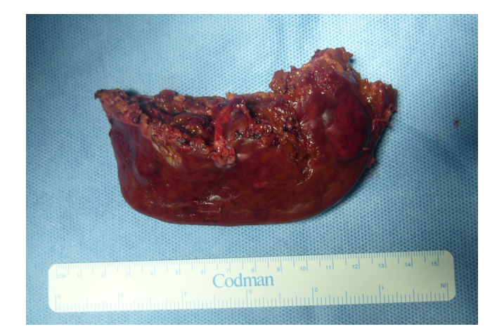
FIGURA 3 – Peça cirúrgica de setorectomia posterior direita laparoscópica

posterior right pedicle was found close to the Ganz fissure after two peri-hilar hepatomies. This was performed using a laparoscopic approach that was named an intrahepatic Glissonian access by Machado, et al.<sup>14,15</sup>. The pedicle was clamped to demarcate the ischemic zone of the posterior right sector and then after demarcation it was stapled suing Endogia stapler. There was always, one ischemic zone, and therefore the hepatic parenchyma was sectioned. The surgical specimen was moved into a plastic bag or gloves, and then the endobag was closed (Figure 3). The closed surgical specimen was resected by means of a Pfannenstiel incision (Figures 1 and 2). Abdominal drainage was generally not performed. When necessary, suction drains were use (in one initial case).