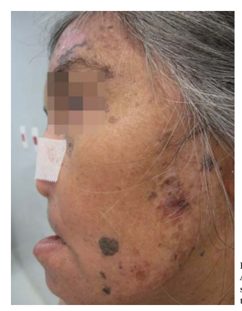
FIGURE 4: Actinic keratosis lesions on the face