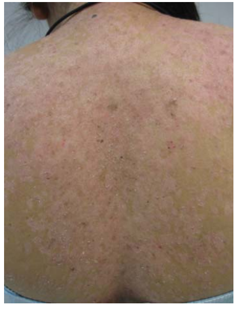
FIGURE 1: Erythematous scaly, pityriasis versicolor-like lesions on the back

mochromic plaques on the backs of hands, erythematous plaques with sharp edges on the neck and abdomen and actinic keratosis lesions on the face (Figures 1, 2, 3 and 4). Negative HIV serology. Biopsy from two different skin lesions (plaques on hand and back), showing acanthotic epidermis with hyperkeratosis and, across the entire thickness of the epidermis, areas permeated by cellular nuclei of moderate size and with small amphophilic citopolasma granules (Figures 5 and 6). Dermis preserved. Clinical and histological picture compatible with epidermodysplasia verruciformis. Patient is receiving oral retinoids, sunscreen and monitoring at the Dermatology Outpatients Clinic.