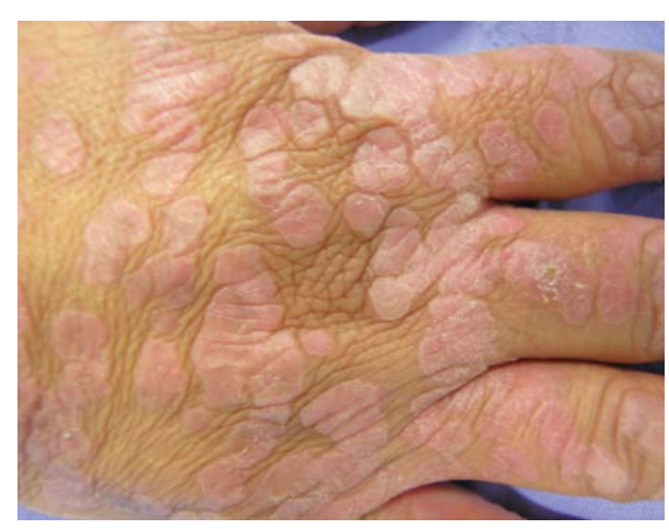
FIGURE 2: Flat warts on the hands

35-year-old female patient complaining of skin lesions present since childhood. Several surgeries were performed over the past 10 years to remove squamous cell carcinomas on the face and upper limbs. 3 years ago a tumor appeared in the right mandibular region. This increased in size and the patient presented at the Head and Neck Department where squamous cell carcinoma was diagnosed by biopsy. Left maxillectomy exision performed. History of consanguinity revealed between the parents (first cousins) and a mother with similar clinical symptoms. The dermatological examination showed multiple disseminated lesions, some in slightly scaling hypopigmented plaques on the back, flat nor-