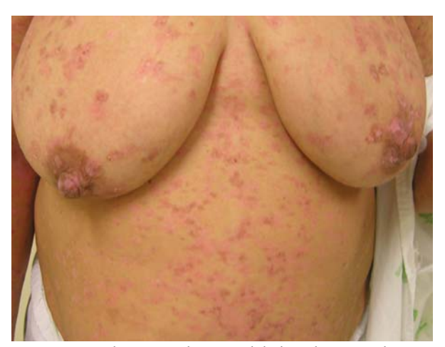
FIGURE 3: Erythematous plaques with little scaling, some brown patches on the trunk and upper limbs