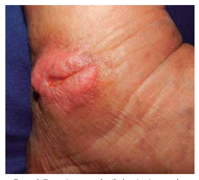
Figure 2: Tumor in greater detail, showing its granular surface and ill-defined edges.

Image 2 was switched for image 3 and vice-versa. Figure 2 should show the image of a skin lesion (ankle nodule) and Figure 3 should show the image of the histopathological exam. The legends are correct. Follows the corrected imags.