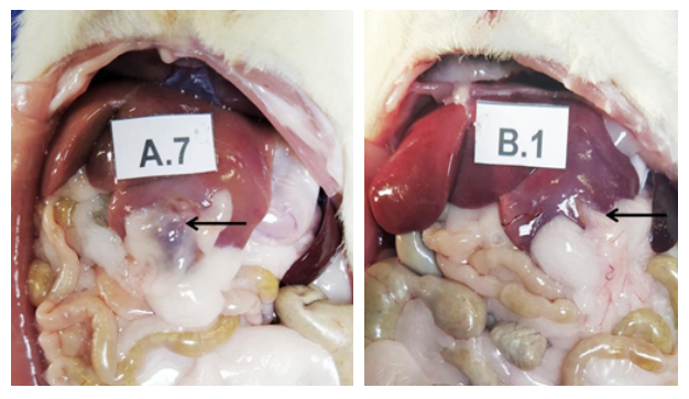
Figure 2 - Examples of adhesions found after seven days of evolution. (A.7) Oxidized regenerated cellulose group; (B.1) Iyophilized hydrolyzed porcine collagen group greater omentum adhered to the site of application of the hemostats.

The result of the inflammatory score showed subacute and chronic reactions in both groups and in both timepoints, with similar frequencies (seven days, p=1; and 14 days, p=0.580).