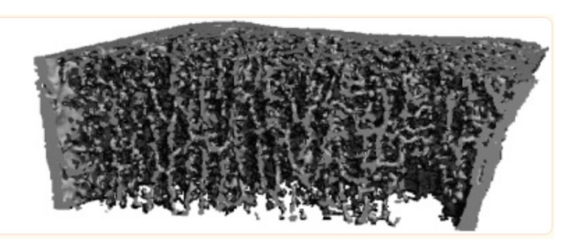
Figure 2. Representative HR-pQCT scan of a study participant with celiac disease illustrating trabecular defects and cortical thinning, adapted from Stein and cols. (44).

Few studies have investigated bone microarchitecture in CD. High resolution peripheral quantitative computed tomography (HRpQCT) non-invasively measures volumetric bone density and skeletal microstructure, providing separate measures for trabecular and cortical bone. A study in 31 pre-menopausal women showed significant deterioration in trabecular and cortical indices in patients with CD versus controls. Radial trabecular density was 26% lower and trabeculae were thinner, fewer and more widely spaced. Cortical density was reduced by 4%. Similar findings were observed at the distal tibia. The microarchitectural deficits were greater in those with symptomatic compared to subclinical CD (43). A subsequent study confirmed these findings and also found reduced whole bone stiffness (a biomechanical indicator of strength, which is associated with fracture) measured by microfinite elemental analysis (FEA) compared to controls (44) (Figure 2). There is no comparable HRpQCT data in men with CD. Based on studies using DXA and HRpQCT, both the quantity and quality of bone appear to be affected by CD.