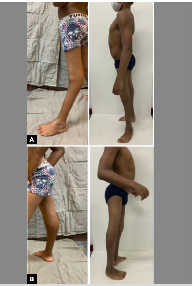
Figure 4. Pre- and post-operative clinical photographs of the left (A) and right (B) lower limbs in profile, showing correction of the recurvatum deformity by posterior epiphysiodesis of the distal femur in a patient with artrogiposys and mild hemiparetic cerebral palsy.