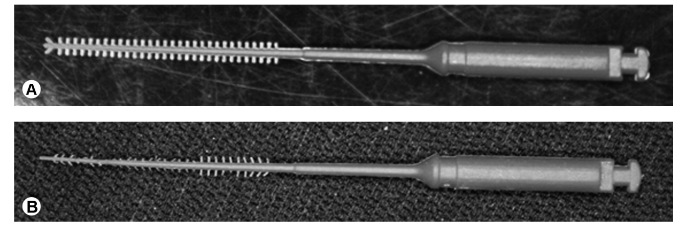
Figure 2. CanalBrush before (A) and after (B) rotation inside the root canal. Deformation of bristles is obvious.

c, f vs i, a vs b, b vs c, a vs c, d vs e, d vs f, a vs d, b vs e: statistically significant difference (p<0.05)