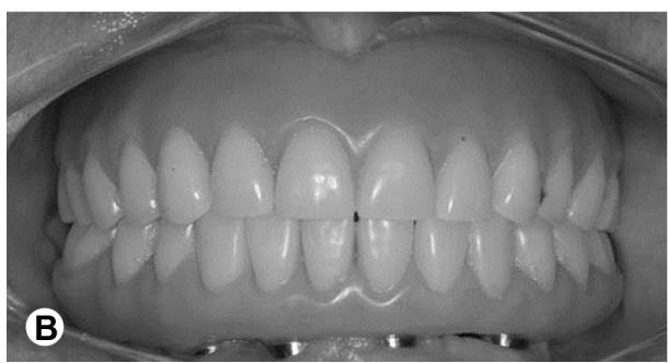
Figure 3. A: Orthopantomograph taken after prosthetic oral rehabilitation showing an adequate dental implants positioning. B: Prosthetic oral rehabilitation with an implant-supported milled bar overdenture in the mandibular arch and a bone-mucous-supported complete denture in the maxillary arch.

asymptomatic third molar retained in severely resorbed mandible if any pathological condition is associated with the tooth (11). Nonetheless, the patient must be aware that this treatment involves periodic appointments and imaging exams and does not eliminate the possibility of a surgical procedure. The patients should be aware of the risks and benefits of conservative and interventionist management approaches, and patients' perceptions should also be included in the decision–making process to provide a more comprehensive assessment of the effectiveness and value of third molar surgery (2,13).