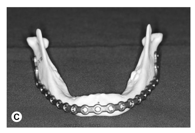
Figure 1. A: Previous orthopantomograph revealing severe reduction of the residual ridges and a mandibular atrophy Class IV according Cawood and Howell (1988). B: CBCT cross-section scan revealing the close relationship between the teeth and the mandibular canals (MC) and a reduced bone volume around the teeth in both sides. Right side is showing the MC passing through the roots of the molar; left side is confirming the carious lesion (c). C: The 2.4-mm locking reconstruction plate adapted passively to the customized prototype model of the mandible.

the surgery, and second, the possibility of a similar future occurrence related to the right molar. The DICOM files acquired from the CBCT scanning were applied to obtain a customized rapid prototype model of the mandible, which that was used to adapt a 2.4-mm locking reconstruction plate (Neo-ortho, Curitiba, PR, Brazil) to the mandible and also to select the screw length previous to the surgical procedure (Fig. 3). The advantages and disadvantages of the extra- and trans-oral surgical approaches were discussed with the patient and she decided for the transoral approach. Under general anesthesia by nasotracheal intubation, the surgical approach consisted in a linear incision on the crest of the alveolar residual ridge from one side to another. The posterior limits were the anterior border of the coronoid process. The anatomical structures related to the mentum foramens were identified bilaterally, dissected and transected in order to ensure an adequate surgical field to put the plate on the mandible.