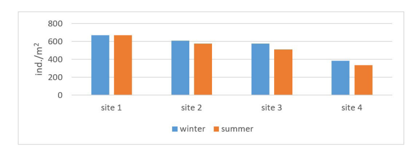
Figure 3. The total density values in the two seasons for Mollusca species in four sites during the study period in 2019.