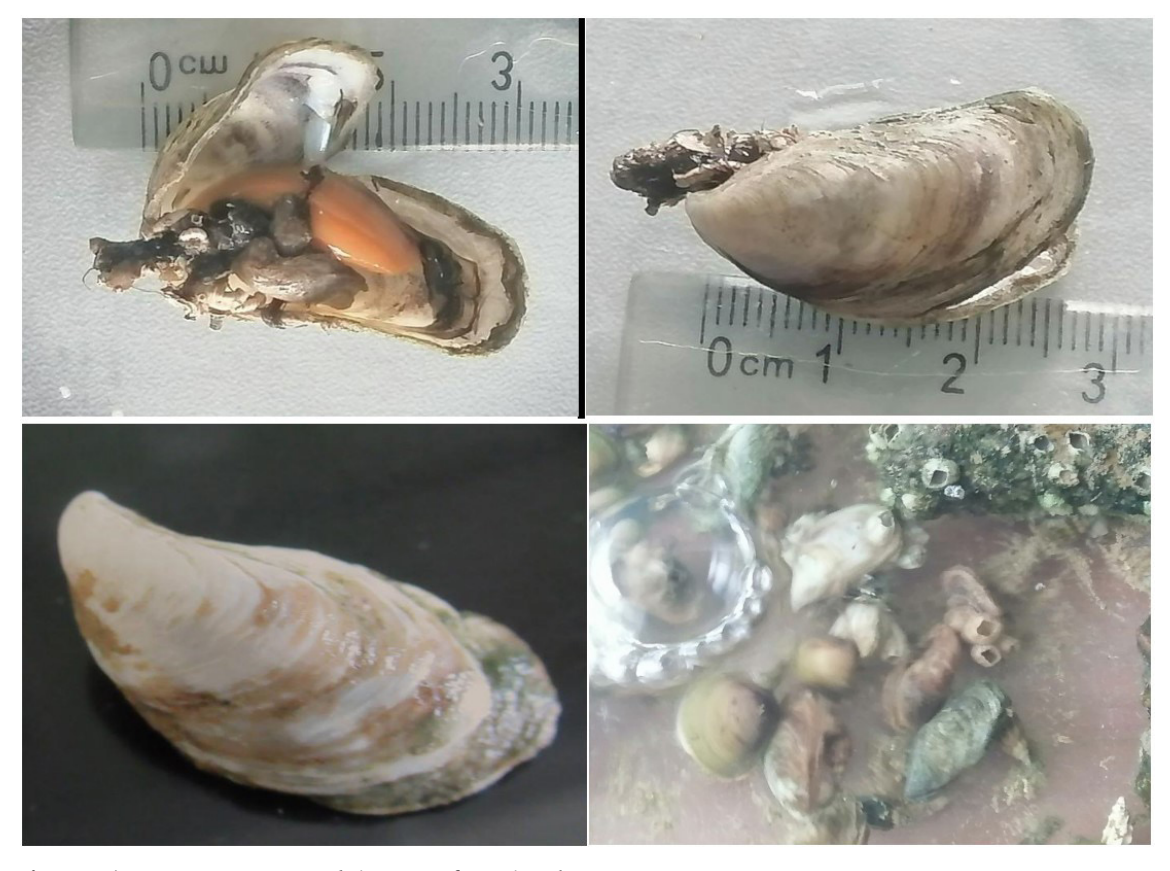
Figure 4. Picture 1, 2, 3, 4 represented Limnoperna fortunei Dunker, 1857.

reproduction during the year, in addition to having the ability to form colonies in places and unstable environmental conditions and great physiological tolerance (Darrigran & Ezcurra de Drago, 2000; Darrigran, 2002). The absence of competition in the freshwater environment and the association of this species with human activities highly increase its dispersion capacity (Darrigran & Ezcurra de Drago, 2000).