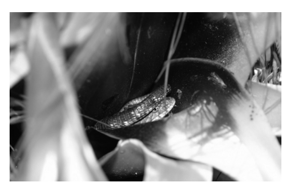
Figure 2. Abronia oaxacae inside the epiphytic bromeliad Tillandsia violácea , in the La Petenera site in El Punto, Santa Catarina Ixtepeji, Ixtlán, Oaxaca, Mexico.

incidence of light may increase considerably due to the deciduous nature of many of the live oaks in the area. The difference in temperature between exposed branches and branches close to bromeliads may reach up to four degrees centigrade, the same as the difference between the temperature on exposed branches and the temperature within the bromeliads (Stuntz et al., 2002). The Abronia specimens collected in this study were found deep within the leaves of the bromeliads, and were rolled up (Figure 2).