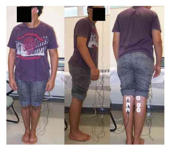
Figure 1 Electrode positioning and subject's posture during examination.

The analysis of the EMG responses was based on the lower limb contralateral to head rotation. The tracings obtained from the two configurations of electrode placement were superimposed after digital filtering and subtraction of the pre-stimulus EMG rectified mean. The responses that reversed polarity after stimulation for both polarity conditions (LCRA and RCLA) were considered to be of vestibular origin.<sup>2-4</sup> The two components (SL and ML) of the vestibular evoked reflex were defined. A response starting between 40 and 70 ms, which was reversed by inverting the polarity of the stimulus, was considered as the SL component; the ML component had opposite polarity to the SL component, beginning at approximately 100 ms after the stimulus (Fig. 2).