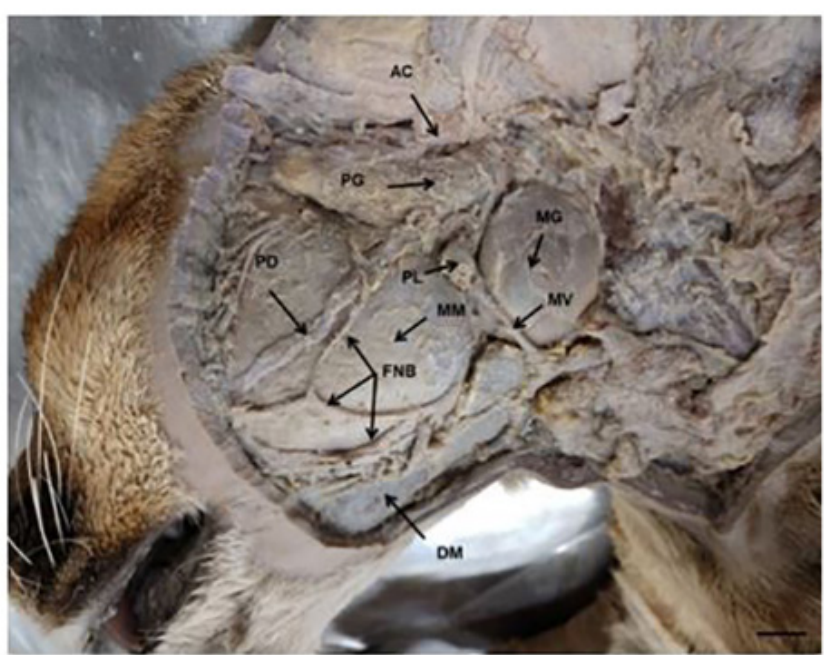
Figure 1: Photograph of the left lateral face of a puma female ( Puma concolor ), showing the parotid salivary gland (PG), parotid duct (PD), mandibular gland (MG), auricular cartilage (AC), facial nerve branches (FNB), masseter muscle (MM), parotid lymph node (PL), maxillary vein (MV) and digastric muscle (DM). Bar scale = 1 cm.

The mandibular salivary gland has a slightly rounded appearance, grayish tint and its surface is lined with a connective tissue capsule. This gland is located in the ventral-caudal region of the face, caudally at the junction angle of the maxillary and lingual-facial veins. Its rostral margin is partially covered by the maxillary vein, while the dorsal-rostral margin is anatomically associated with the parotid lymph node. The mandibular duct originates at the ventral end of the gland, extending deep along the digastric muscle until it reaches the floor of the oral cavity (Figures 1 and 3A). The monostomatic sublingual gland is in direct contact with the rostral edge of the mandibular gland and covered by the mandibular lymph nodes. It has a secretion duct called the larger sublingual duct that usually accompanies the mandibular duct (Figures 2A and 3B). The molar or lingual gland, as it is also known, is a membranous lump of yellowish gray coloration and elongated rectangular shape. Its caudal extremity is dilated and the rostral tapered. This gland is located ventrally to the labial commissure and dorsally to the digastric muscle. Its caudal border is in contact with the masseter muscle and close to the upper labial vein (Figures 2B and 3C).