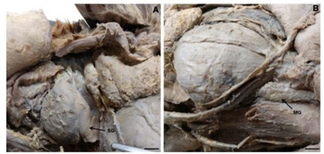
Figure 2: Photograph of the right lateral face of a puma female ( Puma concolor ). (A) sublingual salivary gland (SG). (B) molar gland (MG). Bar scale = 1cm.