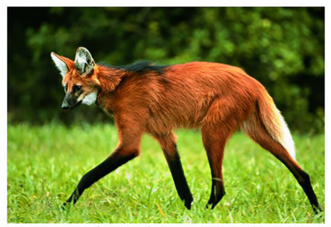
Figure 1. Adult specimen of Maned Wolf ( Chrysocyon brachyurus ).