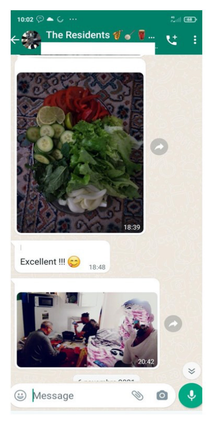
Figura 2. Screenshot of The Residents WhatsApp group illustrating the "sharing an experiences" category.

The second category, with 169 occurrences, is "sharing an experience", which is presented in the form of emojis, written messages, audios, photos or videos, allowing the user to share with the group an activity that he performs in his daily life and that has meaning for him: visits to tourist places, parties, meals, exhibitions, professional and health situations, etc., carried out with or without other members of the group. Figure 2 exemplifies this category, where a user sends a photo of the dish he prepared and, in the second photo, he is in his room with his friends, who are also part of this WhatsApp group, getting ready to taste it. It is important to note that the user is illiterate and does not speak any language other than Dari.