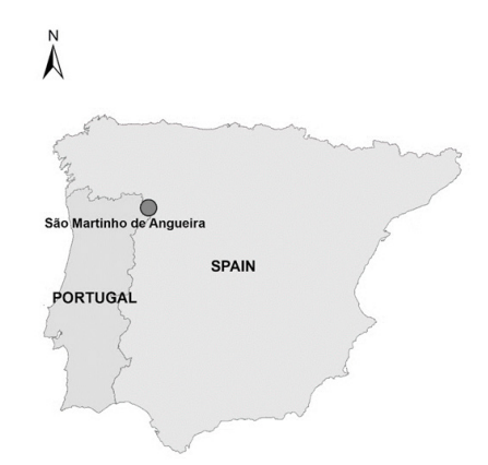
FIGURE I Localization of study area.

The study area is in São Martinho de Agueira (county of Miranda do Douro), northeast Portugal (Figure 1). It refers to agricultural land that was fallowed for six years and planted with chestnut trees in 1999. The plantation was installed with a regular spacing of 3.5 \times 3.0 m (952 trees per ha).