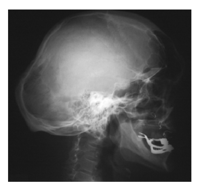
Figure 1 - Lateral skull radiographs showed significant frontal and occipital bossing, multiple wormian bones in the lambdoid suture associated with ill-defined skull base deformity and total loss of teeth.