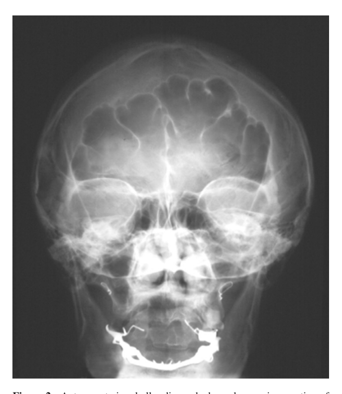
Figure 2 - Anteroposterior skull radiograph showed excessive aeration of the frontal sinuses, osteopenia and total loss of teeth because of dentinogenesis imperfecta.

and quantitative alterations in collagen synthesis.<sup>1-3</sup> Levin et al.<sup>2</sup> have proposed the addition of subtypes A and B to the modified Sillence classification system based on the absence or presence of dentinogenesis imperfecta, respectively. There have been a number of reports that