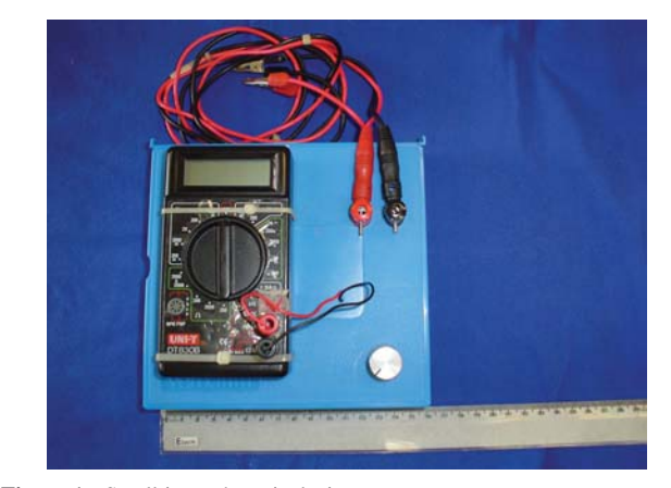
Figure 1 - Small iontophoresis device

A portable, small (15 x 15 x 6 cm) iontophoresis device (Figure 1) was designed and built by the Bioengineering Division of the Heart Institute InCor, São Paulo, Brazil. On its control panel, a knob sets the DC current applied to the skin, and an ammeter displays its value. Internal batteries power it. The electronic diagram of this device is shown in Figure 2. Stainless steel electrodes that are smaller than usual (6-10 cm<sup>2</sup>) were manufactured for our application. Porous tissue dampened with 2% pilocarpine hydrochloride and with saline are respectively