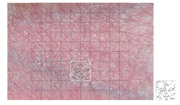
Figure 3 - Image of sweat drops emerging from skin taken by a Nikon digital photo camera and processed using the Image Tools software

In order to record sweat drop images (Figure 3), a digital photo or video camera can be used. The digital videos or photographs (recorded for our study with a Nikon digital photo camera) are computer-processed using picture analysis software (ie, Image Tools) that counts the sweat drops in a given area over a given time interval.