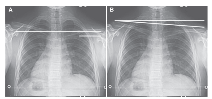
Figure 1. A: CHD B: CA.

After measuring these parameters, the patients were divided into two groups according to the non-structured proximal thoracic curve. The first group included patients who had an HTC less than or equal to 25 degrees. The second group included patients with a