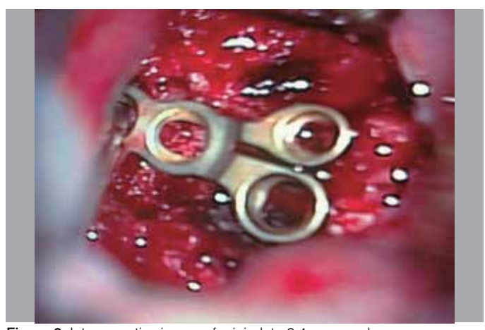
Figure 3. Intraoperative image of mini-plate 2.4 mm used.