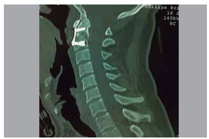
Figure 4. Sagittal CT scan showing fracture osteosynthesis, graft positioned between the odontoid process and body C2 and good cervical alignment.