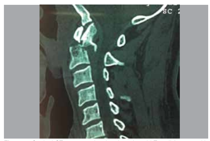
Figure 1. Sagittal CT scan cut showing the odontoid Type II fracture with posterior atlantoaxial dislocation.

The consensus is that these fractures should be treated surgically. In these cases, the posterior cervical approach is commonly used and involves higher morbidity and - in some cases - the inability to completely reduce the fracture.<sup>3,4,6,7</sup> Fa Jing Liu et al.