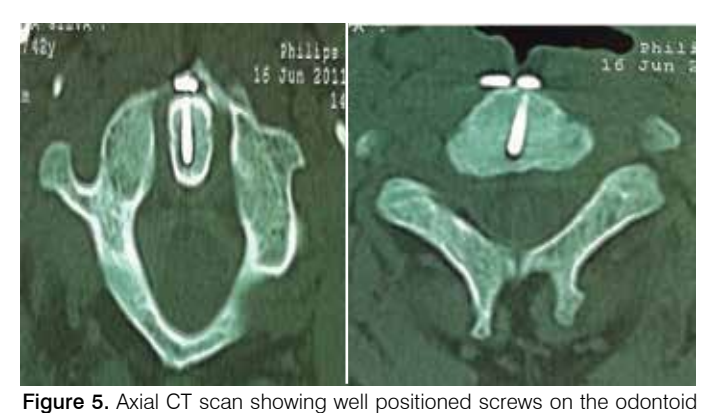
process and the body of C2.

in 2005 described an interesting option. They developed a plate implanted by the transoral approach (TARP System), which enabled reduction and C1-C2 stabilization with a good fusion rate.<sup>2</sup> In 2009, an artificial atlantodens joint was designed in the laboratory that could also be used in these patients, preserving cervical mobility.<sup>5</sup>