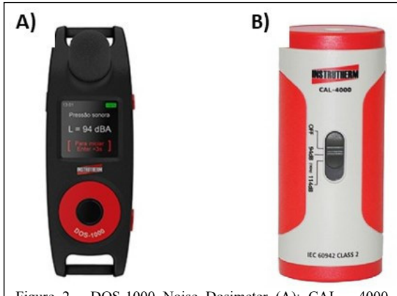
Figure 2 - DOS-1000 Noise Dosimeter (A); CAL - 4000 Calibrator (B).

3) to satisfy the requirements of NR 15 and NHO 01, respectively, in conjunction with an indication of the occurrence of levels above 115 dB(A) (BRASIL, 2020b; FUNDACENTRO, 2001).