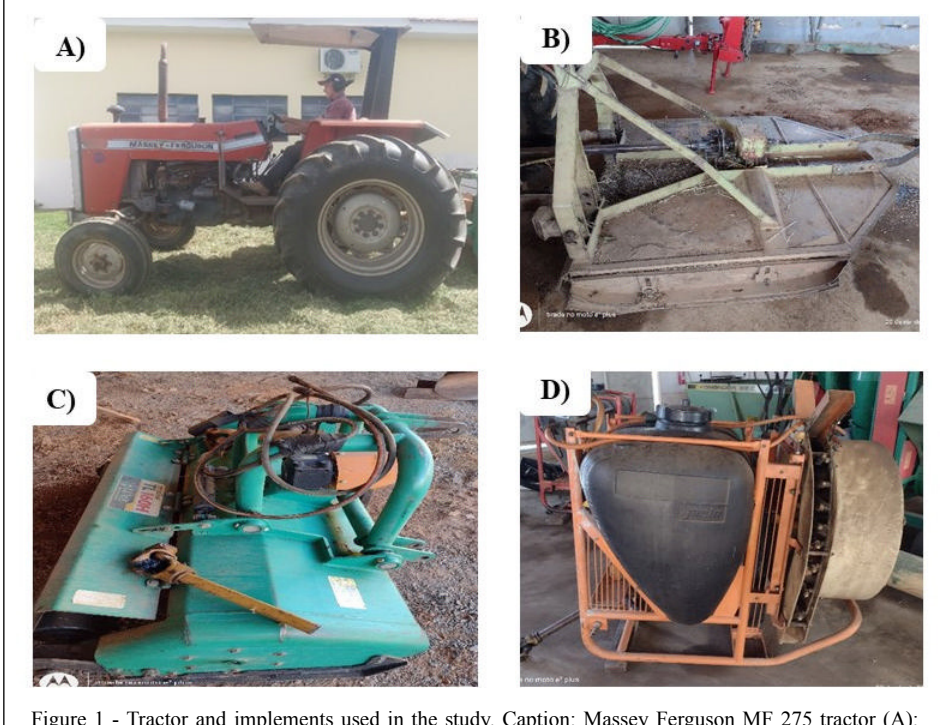
Figure 1 - Tractor and implements used in the study. Caption: Massey Ferguson MF 275 tractor (A); Kamak KD 160 mower (B); LUMA TL 160H brush (C); Jacto 400 turbo atomizer (D).

Prior to the assessments, the dosimeter was configured with the following parameters: an "A" weighting circuit; a slow response circuit; reference criterion: 85 dB(A), which corresponds to a 100% dose for an 8 h exposure; integration threshold level: 80 dB(A); minimum measurement range: 80–115 dB(A); and dose doubling increments (q-5) and (q-