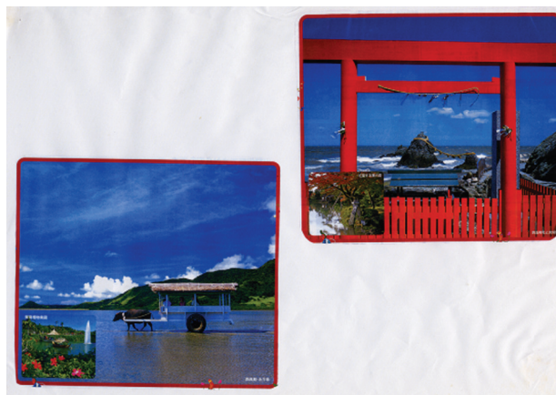
Figure 1. An example of simplification.

In reference to the article, she explained that the person in the center was a scholar. Thus, she stated that she needed to put an English document beside him. She felt a tense atmosphere, and so added a flower to create some feeling of