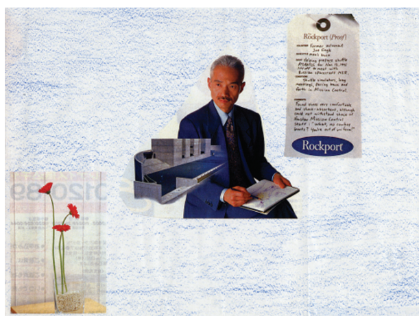
Figure 2. Theme: school and teacher.