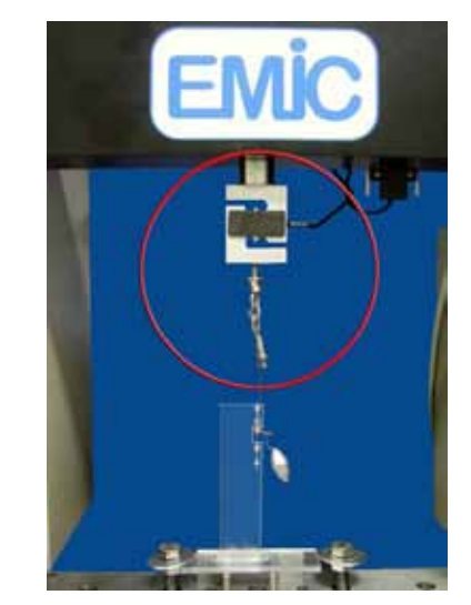
FIGURA 2 - Acrylic plate perpendicularly positioned to the ground on the grip of the testing machine.