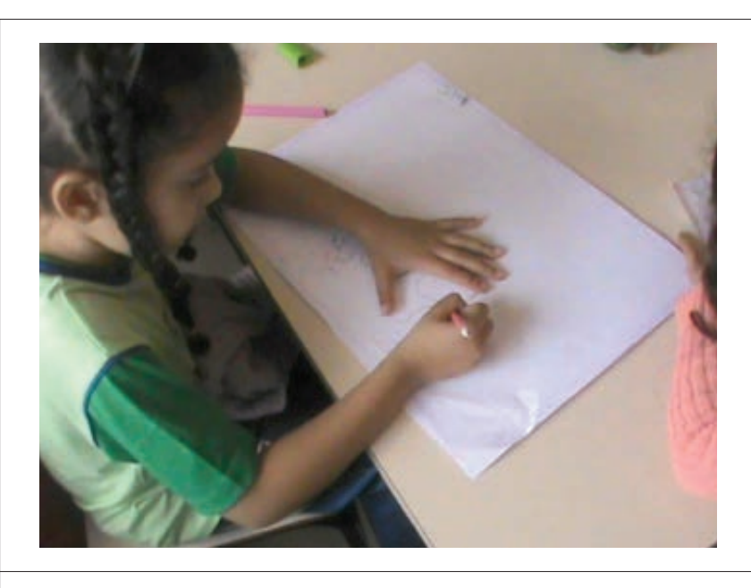
FIGURE 3. Marcus took this photograph. Source: research archives

Researcher: And what are the things you do not like?