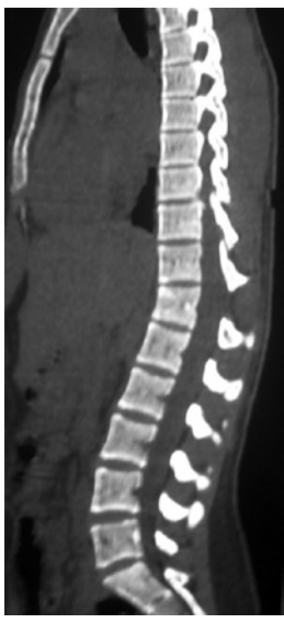
Figure 1. Sagittal computed tomography scan showing an enlargement of T11 and T12 spinous processes, which suggests a ligament injury

There was no pain radiation to lower limbs, numbness or loss of strength. She was immobilized with cervical collar on a spine board and then referred for urgent medical evaluation at a nearby hospital. Physical examination revealed a dorsal midline painful gap and edema on the topography of thoracolumbar transition, but with no neurological impairment. Computed tomography scan revealed a T12 fracture and increased space between T11-T12 spinous processes (Figure 1). Because of the suspicion of a posterior ligament complex injury, a magnetic resonance imaging was done, and it revealed a complete T11-T12 posterior ligament injury (Figure 2).