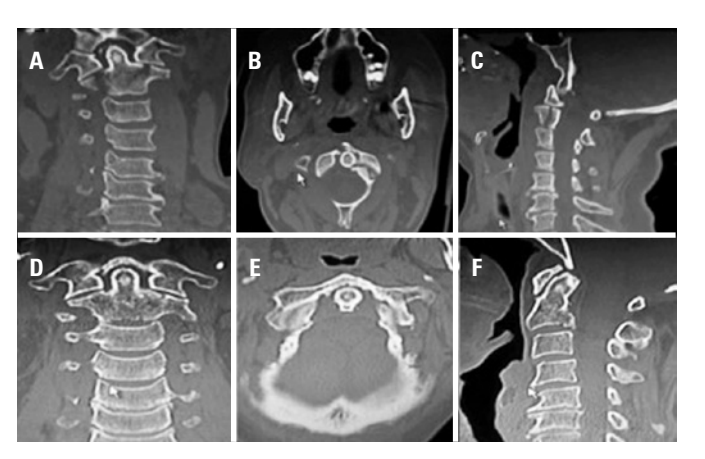
Figure 2. Combined anterior arch of C1 and C2 body fractures - conservative treatment. Line 1: computed tomography images showing the fractures before treatment. (A) coronal, (B) axial, (C) sagittal sections. Line 2: fractures are consolidated after eight weeks of conservative treatment. (D) coronal, (E) axial and (F) sagittal sections

Fractures in a single vertebra were found in 21 patients (87.5%). Three patients had multiple fractures in the spine (12.5%). Among those, one patient (4.2%) had fractures in C1 and C2. Two patientes (8.3%) presented damage in other segments of the spine, in addition to the injuries of the CCJ (T3-T4 and L12).