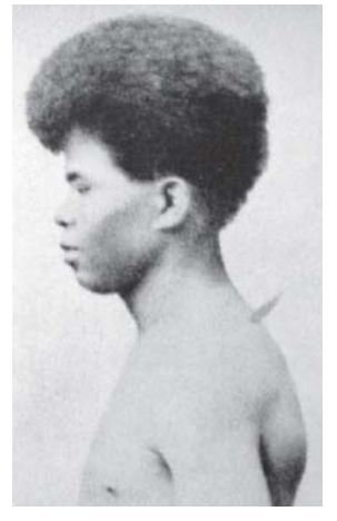
Figure 5: The caption of the photograph underscores the role of eugenics in fighting syphilis and other venereal diseases and in mother and infant protection; illustration from the paper "A luta contra a sífilis e moléstias venéreas em São Paulo" (The fight against syphilis and venereal diseases in São Paulo), presented at the Congress by Mendes de Castro. (Arquivo de Antropologia Física, Museu Nacional/UFRJ).