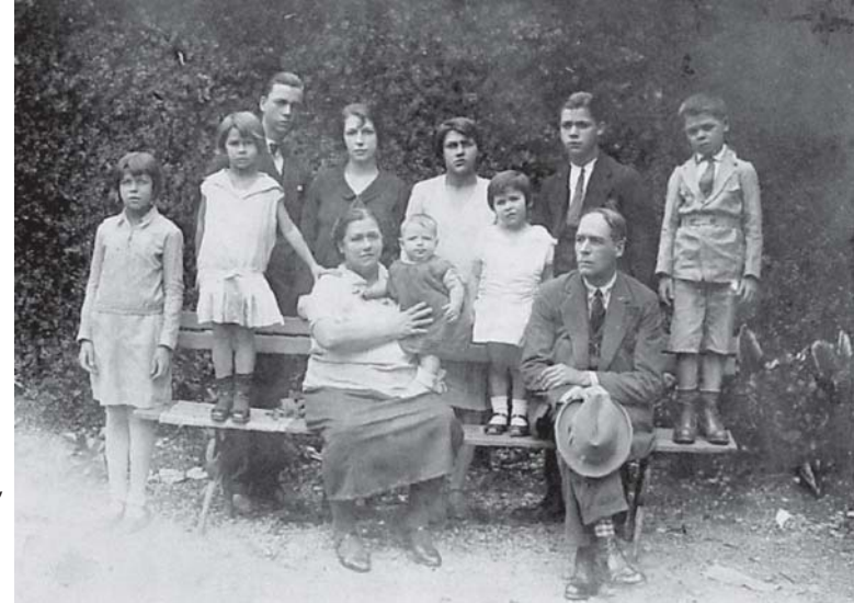
Figure 4: Family of the child who won the eugenics contest; illustration from the paper "A influência da educação sanitária na redução da mortalidade infantil" (The influence of sanitary education on the reduction of infant mortality), presented at the Congress by Maria Antonieta de Castro.