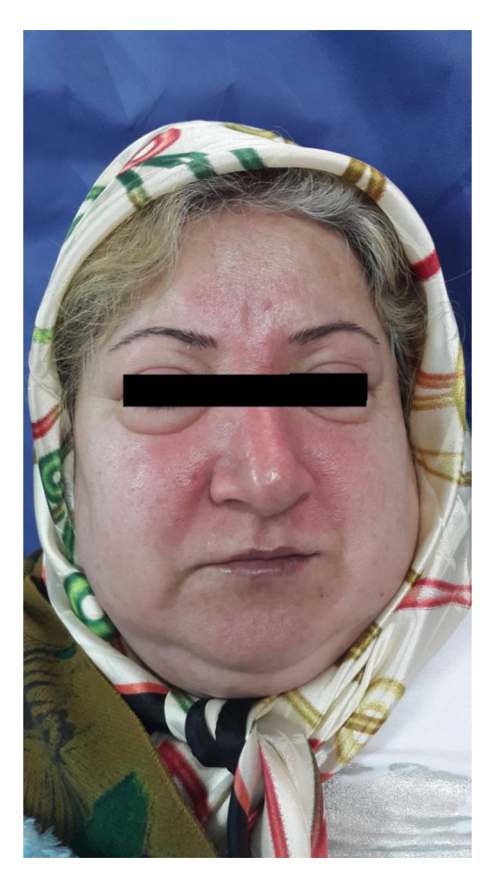
Figure 1 - Face edema.

Laboratory data of the patient are shown in Table 1. Enoxaparin therapy was initiated and core needle biopsy of the mass was performed. The pathology exam identified sarcoma which was confirmed by immunohistochemistry staining (Figure 3). Fifteen days after starting chemotherapy, her upper trunk edema was reduced significantly but the patient suddenly developed dyspnea and expired before any diagnostic procedure was performed. Pulmonary embolism was the most probable cause in spite of the regular enoxaparin injections from the time of her admission.