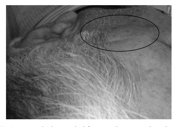
Fig. 1 Increased volume in the left temporal region on physical examination.