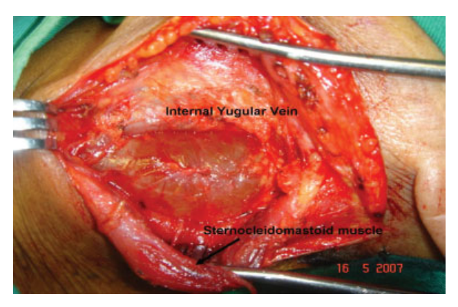
Fig. 3 Surgical view of the second arch branchial cyst.

The 43 patients with a 2<sup>nd</sup> branchial cleft cyst underwent complete surgical excision through a wide mid-neck transverse cervicotomy incision under general anesthesia with orotracheal intubation. These lesions were located superficial to the anterior border of the sternocleidomastoid muscle or adjacent to the carotid sheath ( Fig. 3 ). We did not have any case of cyst located through the carotid bifurcation or deep into the carotid sheath. A lower neck transverse incision was the