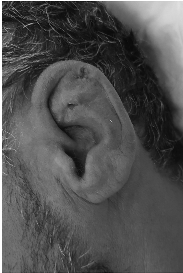
Fig. 8 Same patient after the removal of the drain catheter, in which the pseudocyst disappeared.