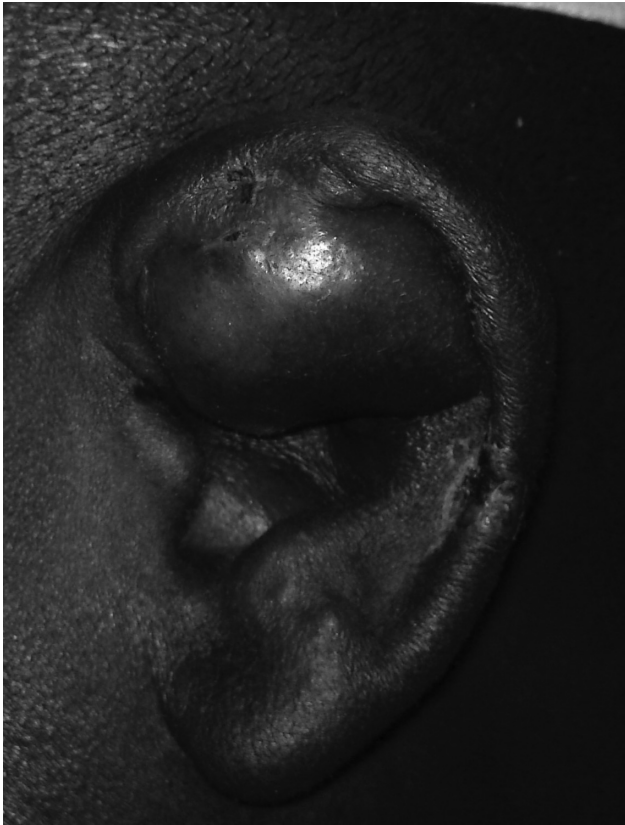
Fig. 5 Pseudocyst of one patient.