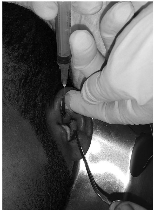
Fig. 4 Daily irrigation with sodium chloride 0.9% and betadine.

The present retrospective study was conducted on all of the patients who presented with painless auricular swelling of long duration. It involved 42 patients, of which 40 were male (95.2%), and two were female (4.8%).