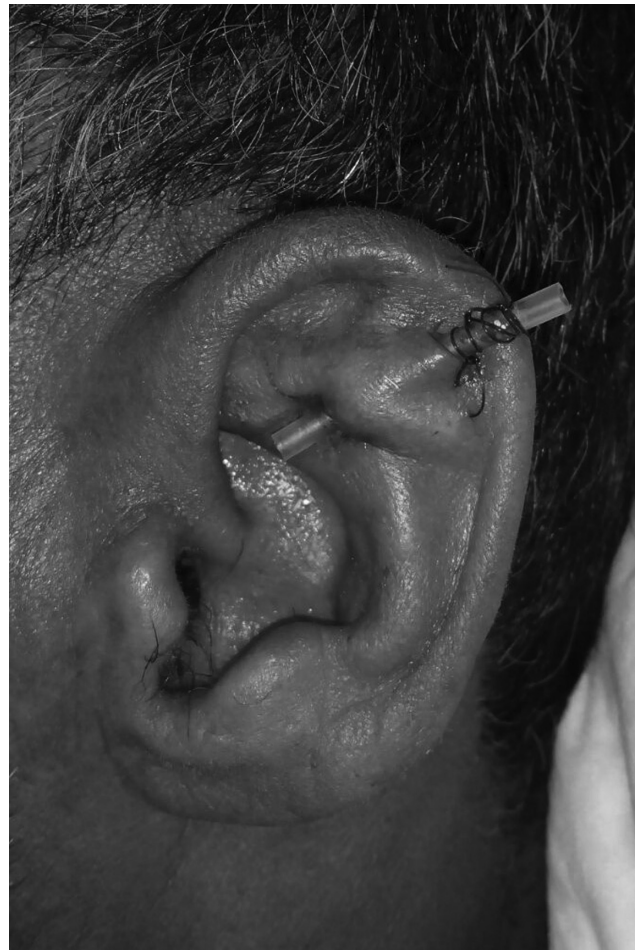
Fig. 7 Pseudocyst in one patient after the insertion of the drain.