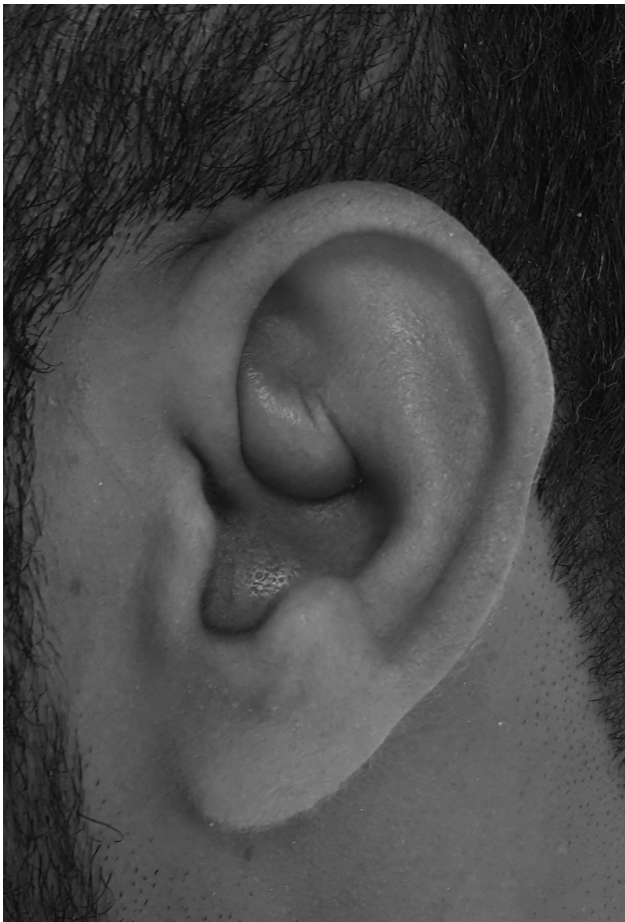
Fig. 1 The pseudocyst as seen before the procedure.

Informed consent was obtained from all patients after they received an explanation of the procedure, of the post-operative care, and of the follow-up.