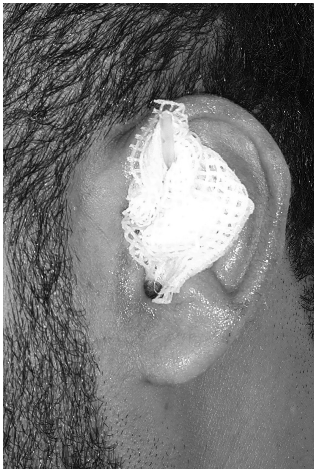
Fig. 3 Vaseline gauze to protect the pinna from the edges of the drain catheter.

Vaseline gauze to protect the ear pinna from any possible injury by the drain free upper and lower edges ( ►Fig. 3 ).