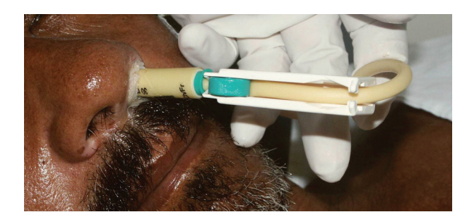
Fig. 2 Securing the Foley catheter in the nose using the valve of the device (a parenteral infusion set).

It is possible to burst the Foley catheter balloon inside the nasopharynx using endoscopy and a perforating instrument. Nevertheless, bursting the Foley catheter balloon may release free fragments of latex.<sup>12</sup>