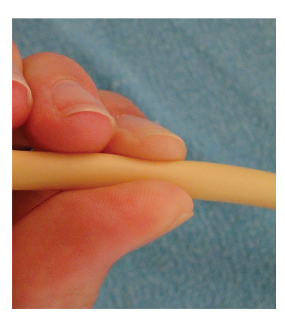
Fig. 3 Squeezing the Foley catheter with the fingertips may restore permeability of the segment of tube collapsed by the device used to secure the catheter in the nose.

Bursting a Foley balloon containing liquid inside the nasopharynx may theoretically result in bronchoaspiration; however, the volume of liquid used to inflate the balloon is small, <sup>13</sup> and for anatomical reasons it is more likely to reach the oropharynx in the form of posterior drainage.