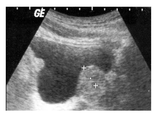
Figure 1 – Sagittal views of bladder and prostate using transabdominal ultrasonography. Vertical distance from tip of protrusion to base of bladder is the intravesical prostatic protrusion measurement.

The statistical analysis was performed through Kruskal-Wallis and Dunn's post test to multiple comparison, and area under ROC curve, using MedCalc version 5.00.019 and SAS System for Windows version 9.1.3.