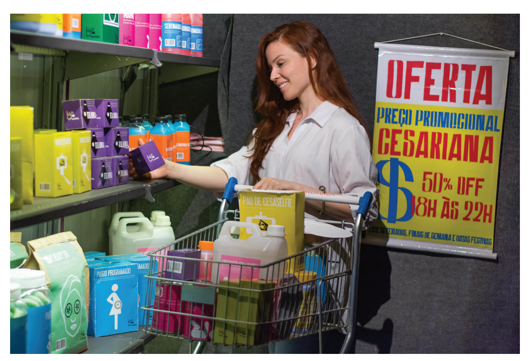
Figure 2. Convenience store