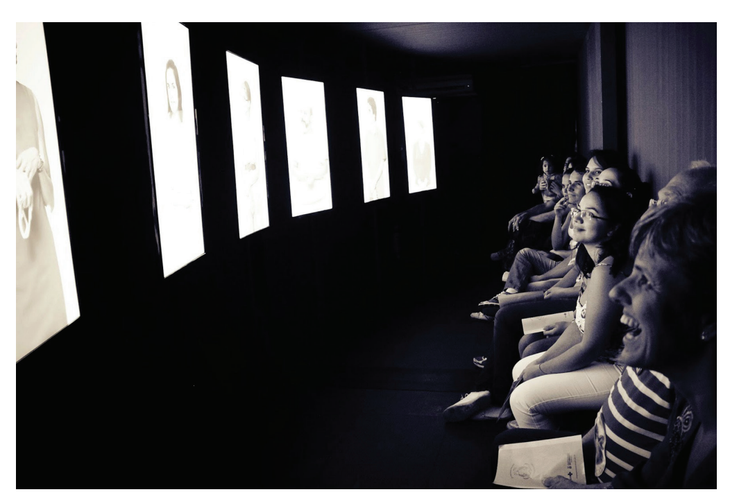
Figure 3. Controversies

After participating in the debate, visitors are directed to an room simulating a large uterus, where they have sensory experiences of birth: they feel the "placenta-sofa", hear the mother's heartbeat, get feel and play with the umbilical cord, and pass through the birth canal, listening to the voice of a baby who asks the mother to be patient and to wait for the birth at the right time.