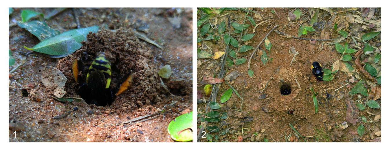
Figs 1, 2. Construction and nests of Epicharis (Hoplepicharis) fasciata Lepeletier & Serville, 1828 at the Jardim Botânico of Rio de Janeiro:1, female constructing her nest; 2, female inside her nest and another flying in the nesting area.

The provision of the brood cells was a compact and slightly moist mass of orange pollen (Fig. 5) which occupied approximately one third of the brood cell. The pollen was probably mixed with nectar and/or oil from the flowers of any of the species of Malpighiaceae present in the JBRJ. The specific floral sources were not identified.