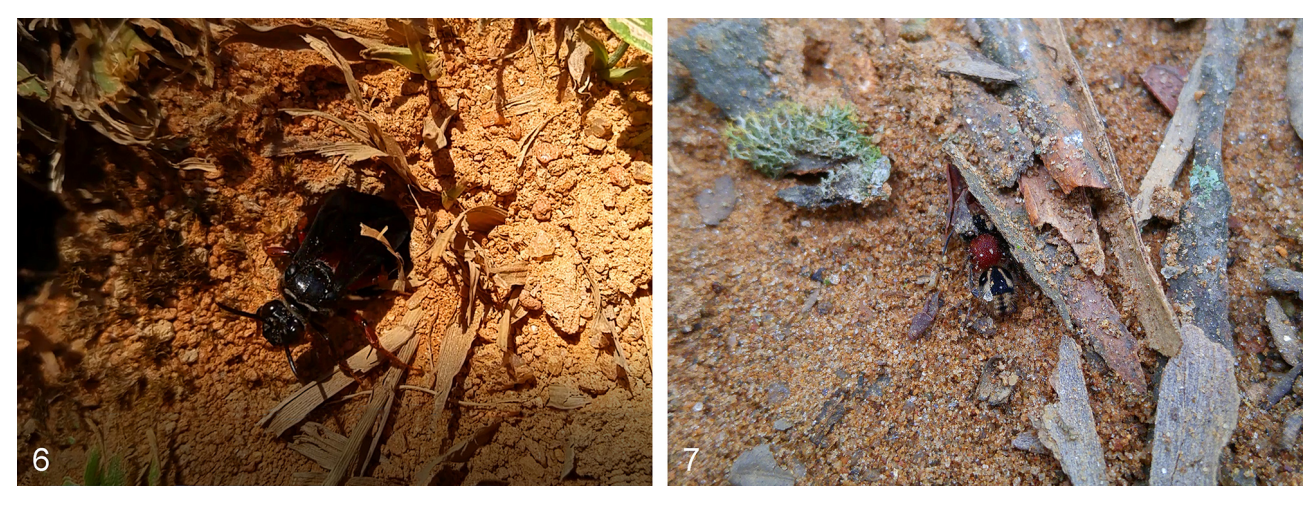
Figs 6, 7. Insects associated with Epicharis (Hoplepicharis) fasciata Lepeletier & Serville, 1828: 6, female of the cleptoparasitic bee Rhathymus bicolor Lepeletier & Serville, 1828 leaving a nest;7, female of Pseudomethoca sp. walking through the nesting area.

The results here obtained somewhat agree with those known for other species of the genus. The ground nesting habit, a well-defined seasonality, diapause in the pre-pupa stage, and the absence of cocoon reinforce the attributes found in species of Epicharis .