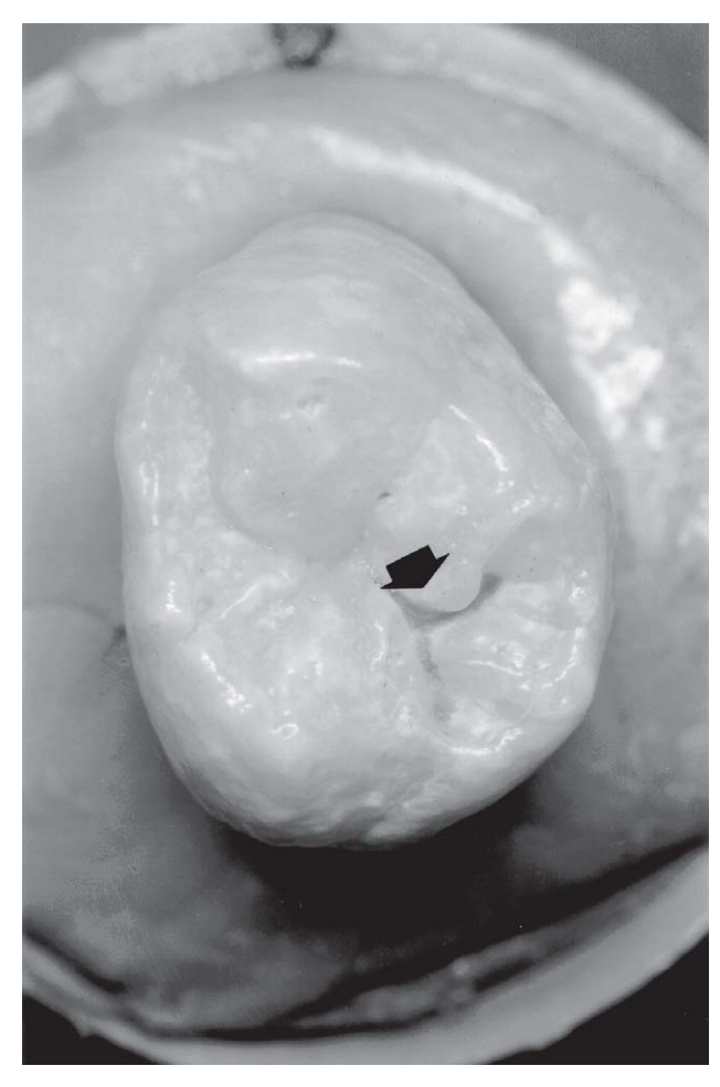
FIGURE 1- Macroscopic aspect of site (arrow) of the occlusal surface of a third molar evaluated by visual inspection, visual inspection and blunt-tipped probes (Tactile), endoscopic evaluation (AccuCam), conventional bite-wing (RxC), direct bite-wing digital radiography (RxD) and direct digital radiography with contrast and brightness control (Rxcb) method

The mapped sites (Figure 1) were dried, illuminated and inspected by the naked eye. The diagnosis for each site was recorded on an individual site, which was exclusive for each examiner. The following criteria, as adapted from Lussi<sup>18</sup> (1991), were used: 0 - absence of carious lesion; 1 - carious lesion in superficial enamel; 2 - carious lesion in deep enamel; 3 - carious lesion in dentin without pulpal injury; 4 - carious lesion in dentin with pulpal injury.