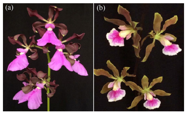
Figure 1. Floral morphology of studied species: Encyclia cordigera (a) and Encyclia randii (b).

Brazil (coordinates: 1° 22' 20.96" S/48° 23' 34.14 W). A sample of E. randii , native to the Amazon region, is already deposited in the Goeldi Museum Herbarium (MG 205037), Belém, PA, Brazil, while waiting for the subsequent flowering of E. cordigera to deposit an exsiccate in the Goeldi Museum Herbarium. Encyclia cordigera has its origins in Central America. The flowers of E. cordigera and E. randii were collected at 6 am to extract their volatile constituents.