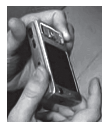
Figure 4. Manipulating the phone in unexpected ways.

The game was so designed that when a player finds the treasure, the game starts over again. The game plays the opening door sound again to communicate this event.