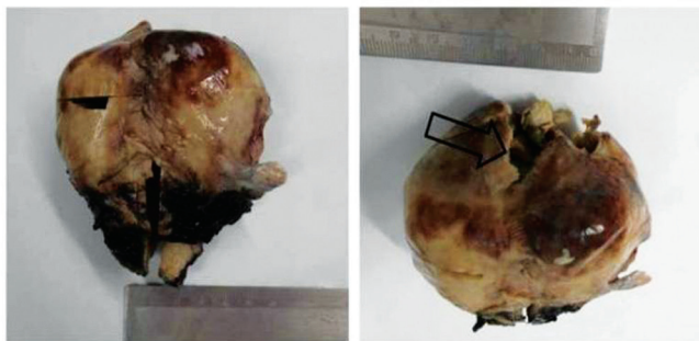
FIGURE 2 – The resected uterus. The arrow points the possible perforation site