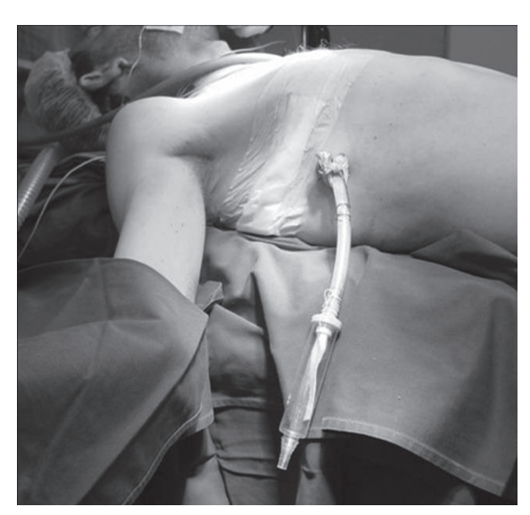
Figure 1 – One-way flutter valve attached to the chest tube in the immediate postoperative period.

pulse oximetry and noninvasive determinations of arterial blood pressure. Following lobectomies and segmentectomies, most patients spent the postoperative period in intensive care units.