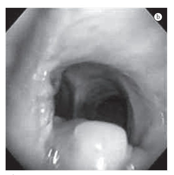
Figure 3 - In a), tracheoesophageal fistula of 5 mm. In b), complete resolution 7 days after the device had been removed.