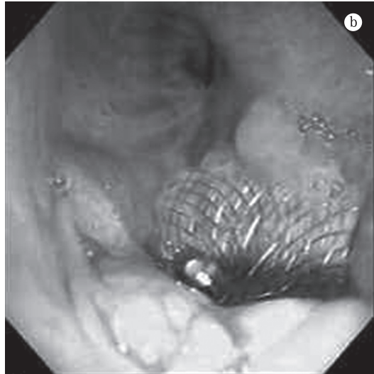
Figure 1 – In a), bronchopleural fistula after right upper lobectomy. In b), appearance of the site 180 days after the device had been placed.