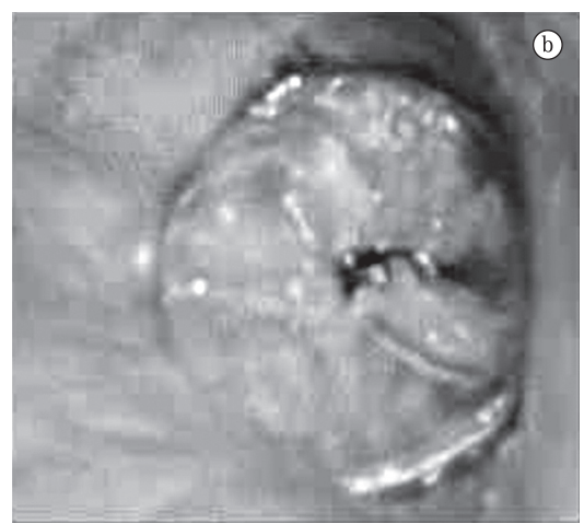
Figure 2 – In a), complete stump fistula after right pneumonectomy. In b), appearance of the site immediately after the device had been placed.

discharged from the hospital 5 days after the procedure.