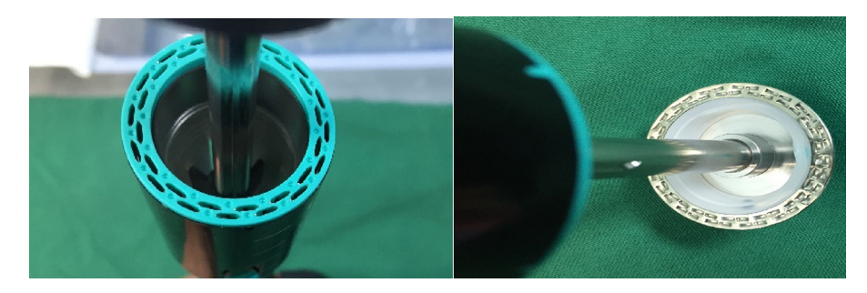
Fig. 6 - View of the circumference of the stapler.

Pseudo aneurysm of the superior rectal artery has been reported,<sup>5</sup> Pseudo aneurysm of the cystic artery or right hepatic artery after cholecystectomy and inadvertent lateral wall injury to the vessel, is well documented.<sup>2,8</sup> So is splenic artery or left gastric arterial pseudo aneurysm secondary to pancreatic pseudocyst or pancreatic necrosis. But to our