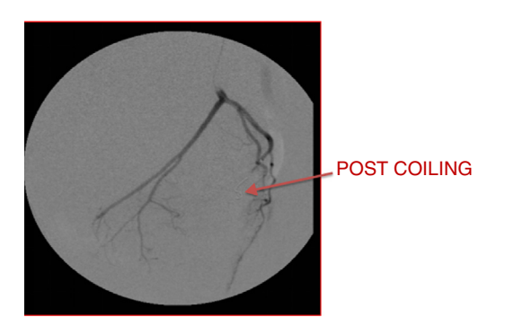
Fig. 4 – Superior rectal artery embolization using microcoil (2 mm × 2 cm).