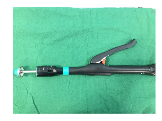
Fig. 5 - Stapler.

The crucial step in the MIPH is the stapler excision of the anal columns above the dentate line, resulting in repositioning of the hemorrhoids into a more proximal site. This involves a purse string that invaginates the wall of the anorectum into the shaft of the stapler.<sup>2</sup> If the stapler head is larger, a correspondingly larger portion of the wall is included, and this would result in perirectal tissues being within the firing stapling position.<sup>3,4</sup> The superior haemorrhoidal artery runs very close to the wall of the rectum, and inclusion of a part of its wall would cause a pseudo aneurysm, which did not respond