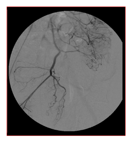
Fig. 2 - Inferior mesenteric artery (IMA) angiogram.

was obtained, which showed a pseudo aneurysm of the left superior haemorrhoidal artery, with active leak of contrast, signifying an ongoing bleed, known as the light bulb sign (Fig. 1). Immediate embolization was completed, with sealing of the contrast leak immediately demonstrated (Figs. 2–4). Thereafter, the patient had a smooth postoperative course, with no further complications.