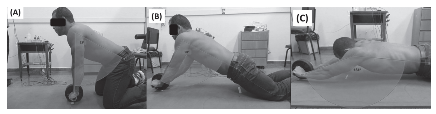
Figure 1 - Ab Wheel Rollout exercise: (A) neutral position; (B) 90 degrees position; and (C) 150 degrees position.

sEMG data was then normalized to the RMS peak of the two peak MVICs, the first second was removed from the normalized RMS, and the following 3 seconds of each trial was integrated (iEMG).