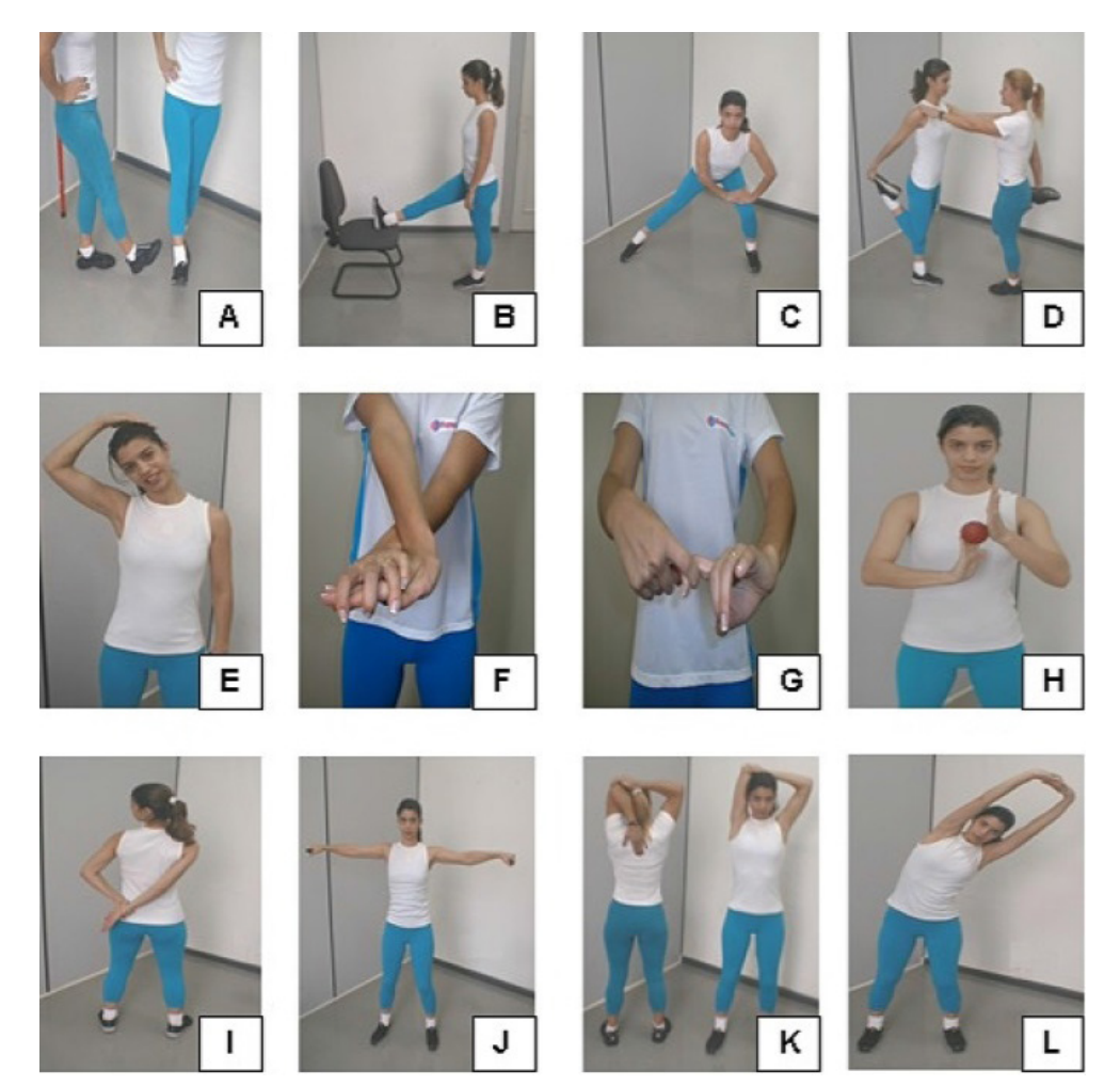
Figure 1. Representative exercises of SBP in AW and SW: ankle (A), hip and knee (B), hip, trunk and knee (C), knee (D), neck/cervical (E), wrist and forearm (F), fingers (G), wrist and hands (H), shoulder and neck (I), shoulder (J), shoulder and elbow (K) and trunk and shoulder (L).

We used Yellow / Red and Thin / Medium Theraband Resistance Bands <sup>TM</sup> in resistance exercise for AW and Red / Green and Medium / Heavy Theraband Resistance Bands<sup>TM</sup> for SW. We prioritized dynamic stretching with the recruitment of a larger number of joints and muscle groups in each exercise in the SW and static stretch with the selective and progressive recruitment of joints and muscle groups in the AW (Figure 2).